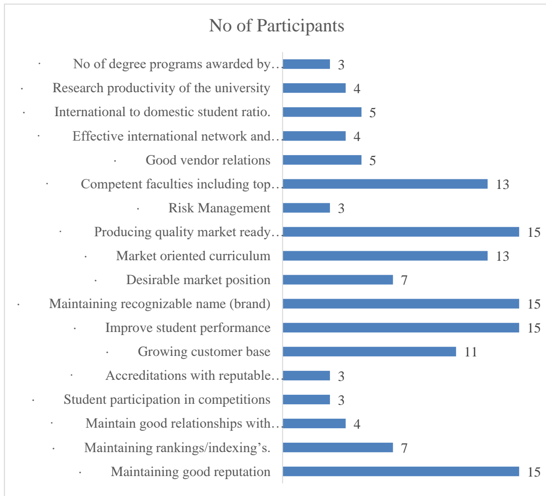
Figure 3. Summary of Open Coding: Factors affecting to the sustainable competitive advantage in higher education